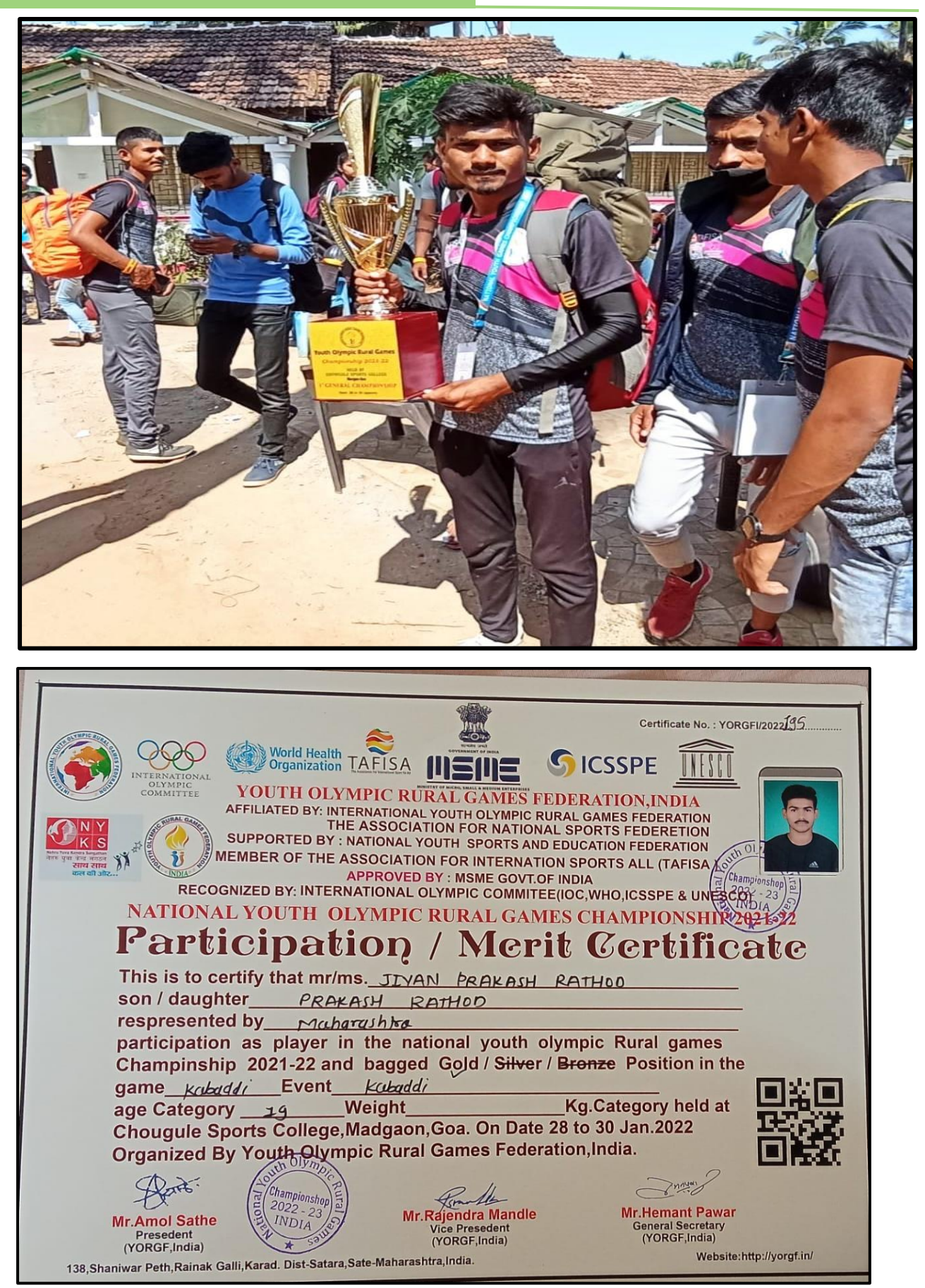
National level Gold Medal and Certificate in Kabbadi Organized by Youth Olympic Rural Games Federation, India