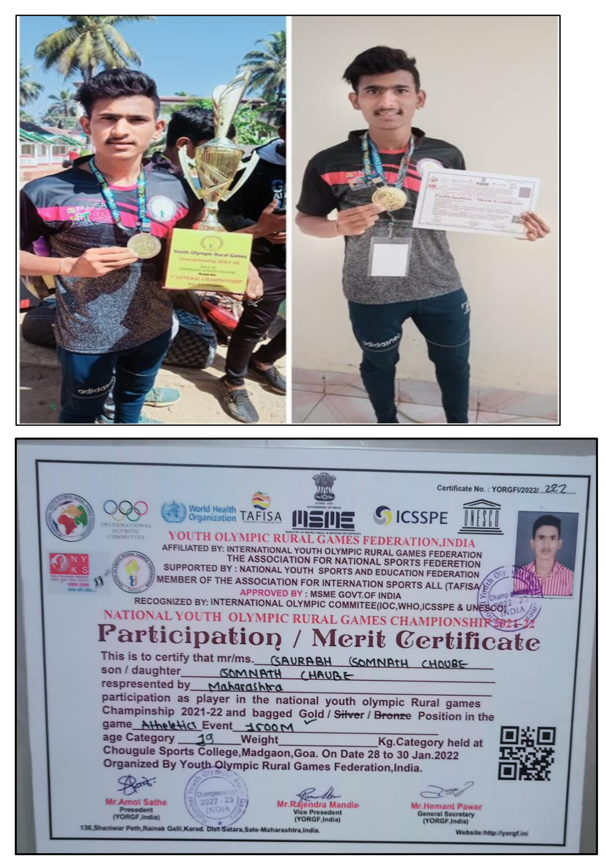
National level Gold Medal and Certificate in Athletics Organized by Youth Olympic Rural Games Federation, India