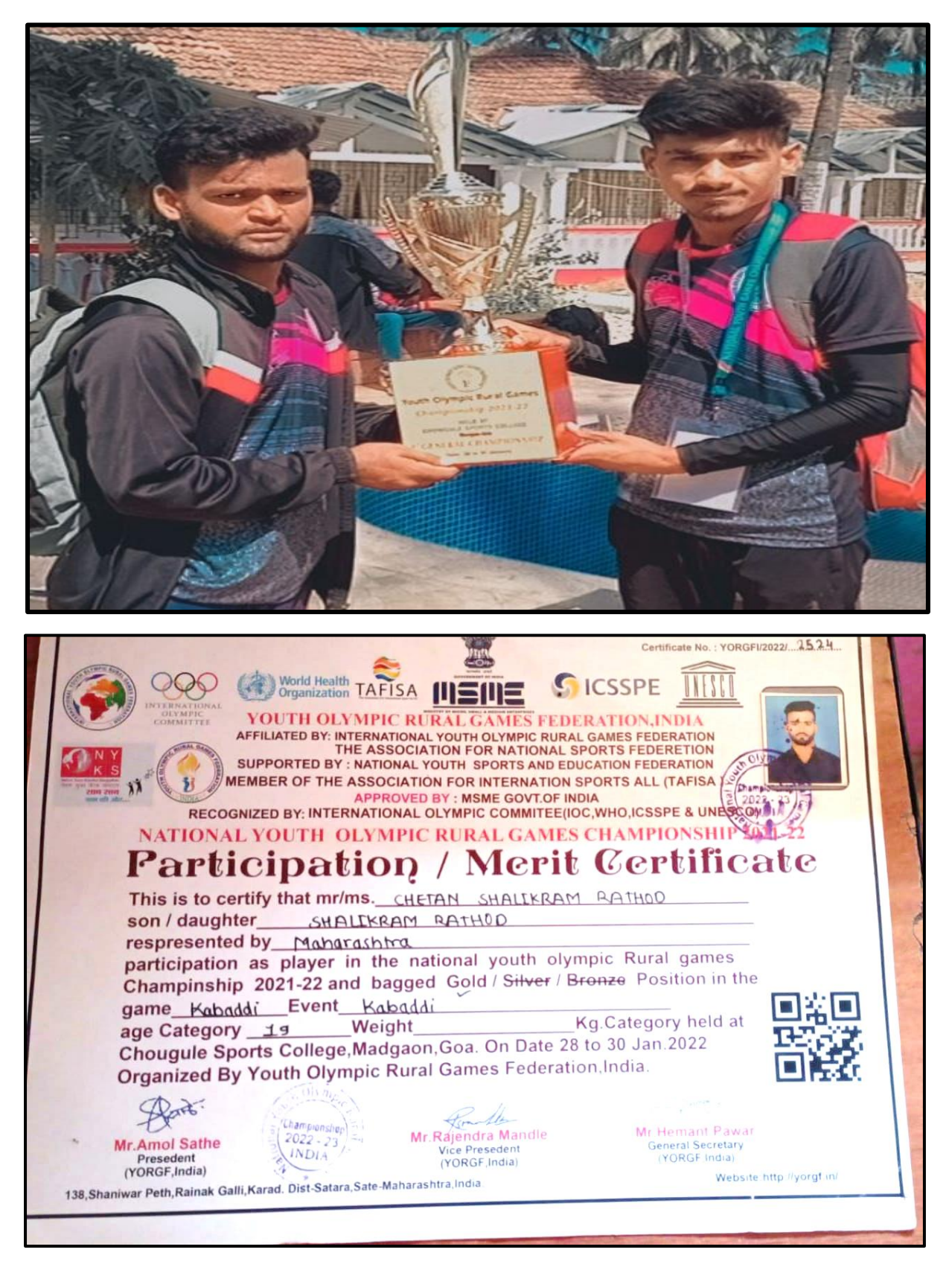
National level Gold Medal and Certificate in Kabbadi Organized by Youth Olympic Rural Games Federation, India