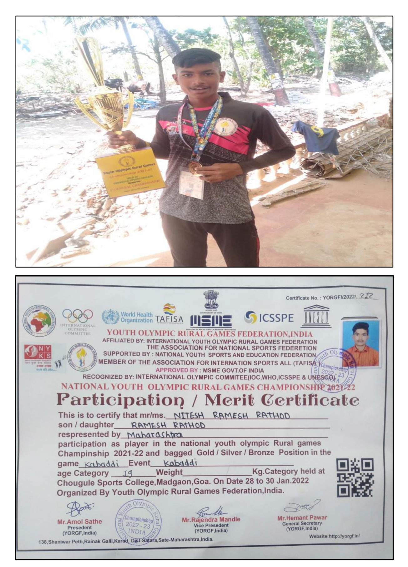
National level Gold Medal and Certificate in Kabbadi Organized by Youth Olympic Rural Games Federation, India