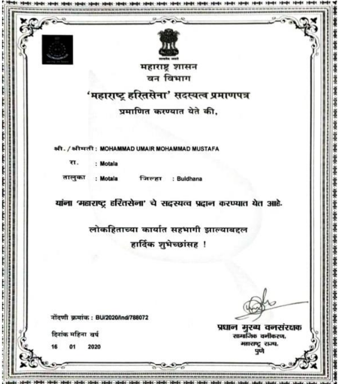
“Maharashtra Green Army” Membership Certificate of Student